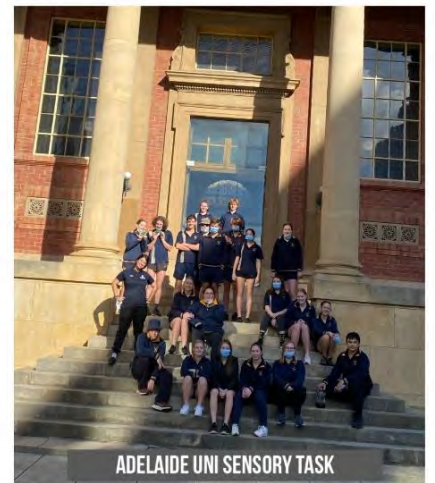
ADELAIDE UNI SENSORY TASK