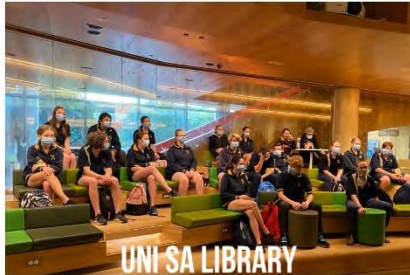
UNI SA LIBRARY