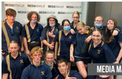
MEDIA MAKE UP & SPECIAL EFFECTS