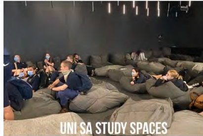
UNI SA STUDY SPACES