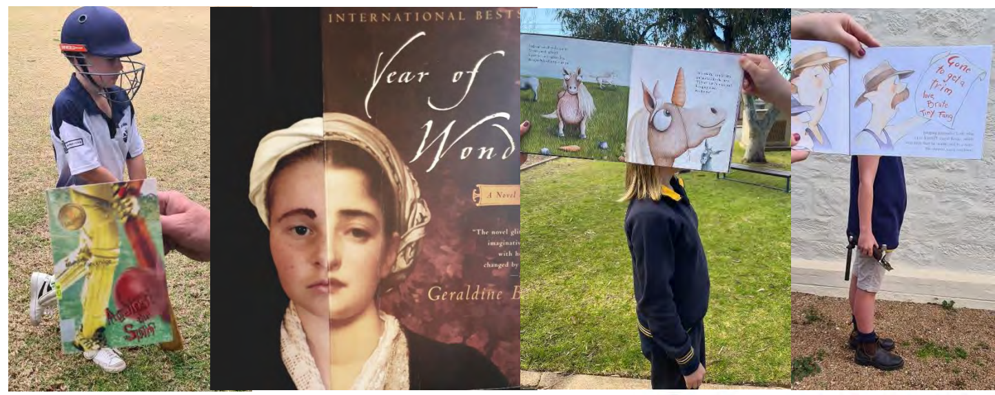
Respect Excellence Integrity Honesty Loyalty